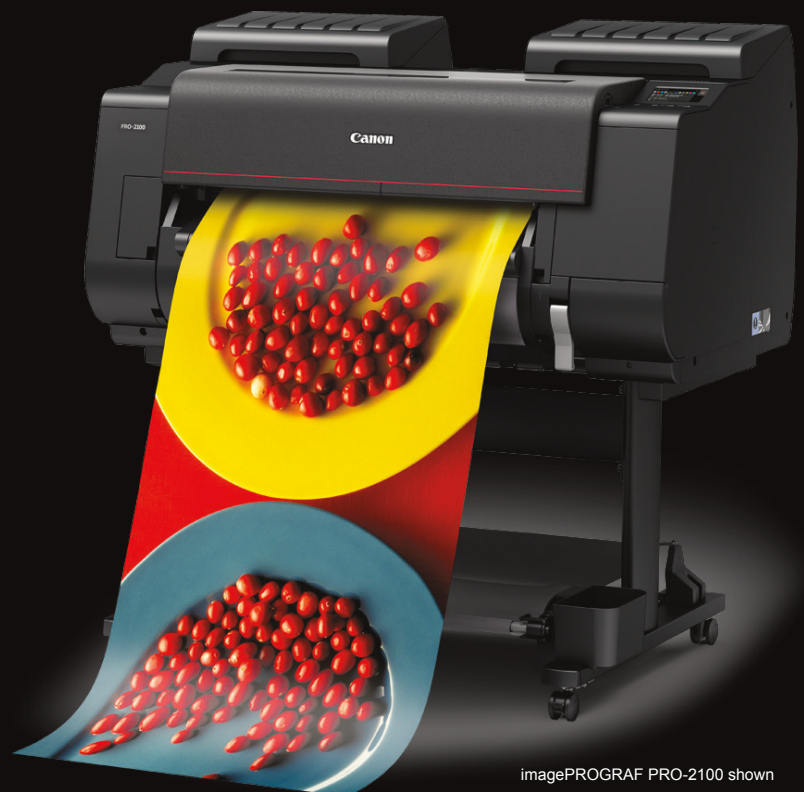
imagePROGRAF PRO-2100 shown